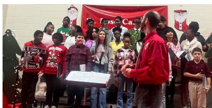
"The best way to spread Christmas cheer, is to sing loud for all to hear." Elf ———>