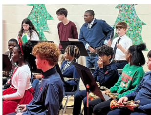
Jr. High band and choir preparing for the program. They all did a great job.