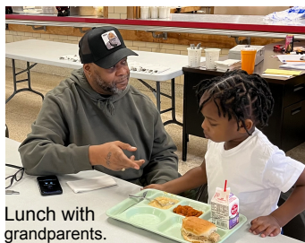
Lunch with grandparents.

The 2nd quarter ends on December 19. Grade cards will go out after we return from break.