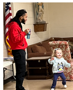
Working on gross motor skills - chasing and catching bubbles.